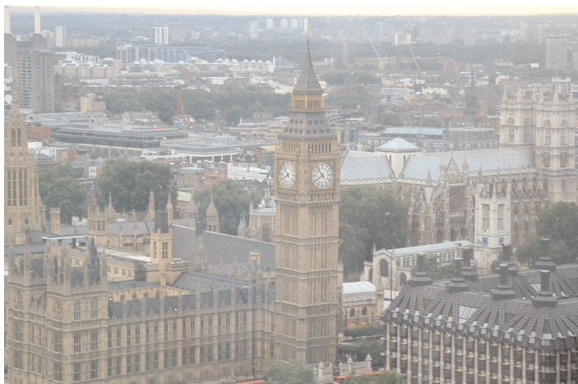
Historic London, England was the site of the inaugural meeting of ATP's new European Division.

He said that among the goals that were decided upon for the coming year were: Enact a founding membership discount for new E-ATP members in 2007; Form working groups to construct a website and organize an event in September 2007; Initiate membership development with some of the CEOs of larger test publishers; Set up contacts with affiliated organizations, and to initiate the adoption of quality standards from other organizations.